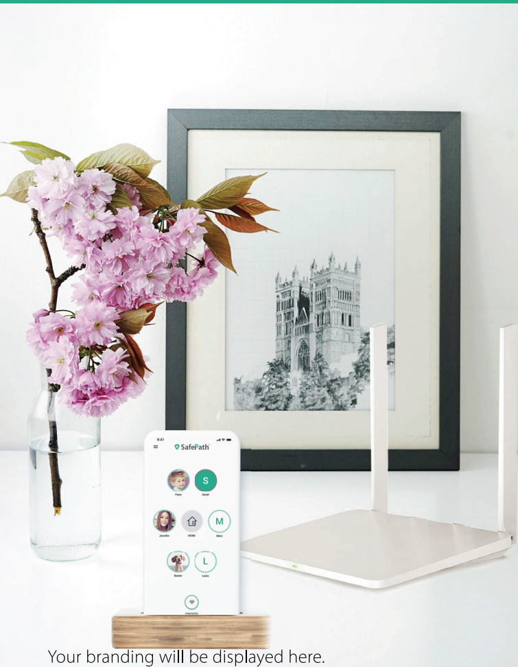
Your branding will be displayed here.

Add a valuable product to your family safety line-up and increase sales, revenue and customer LTV.